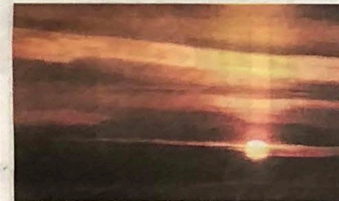
Cloudy Sunset