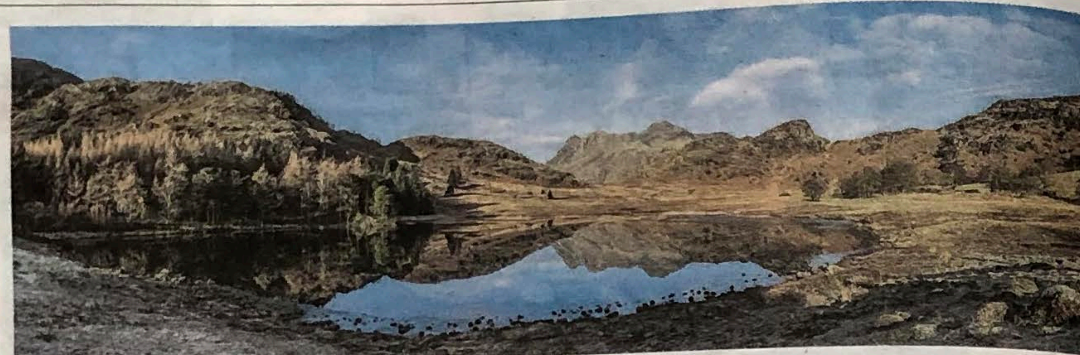
Blea Tarn Kevin Thorne