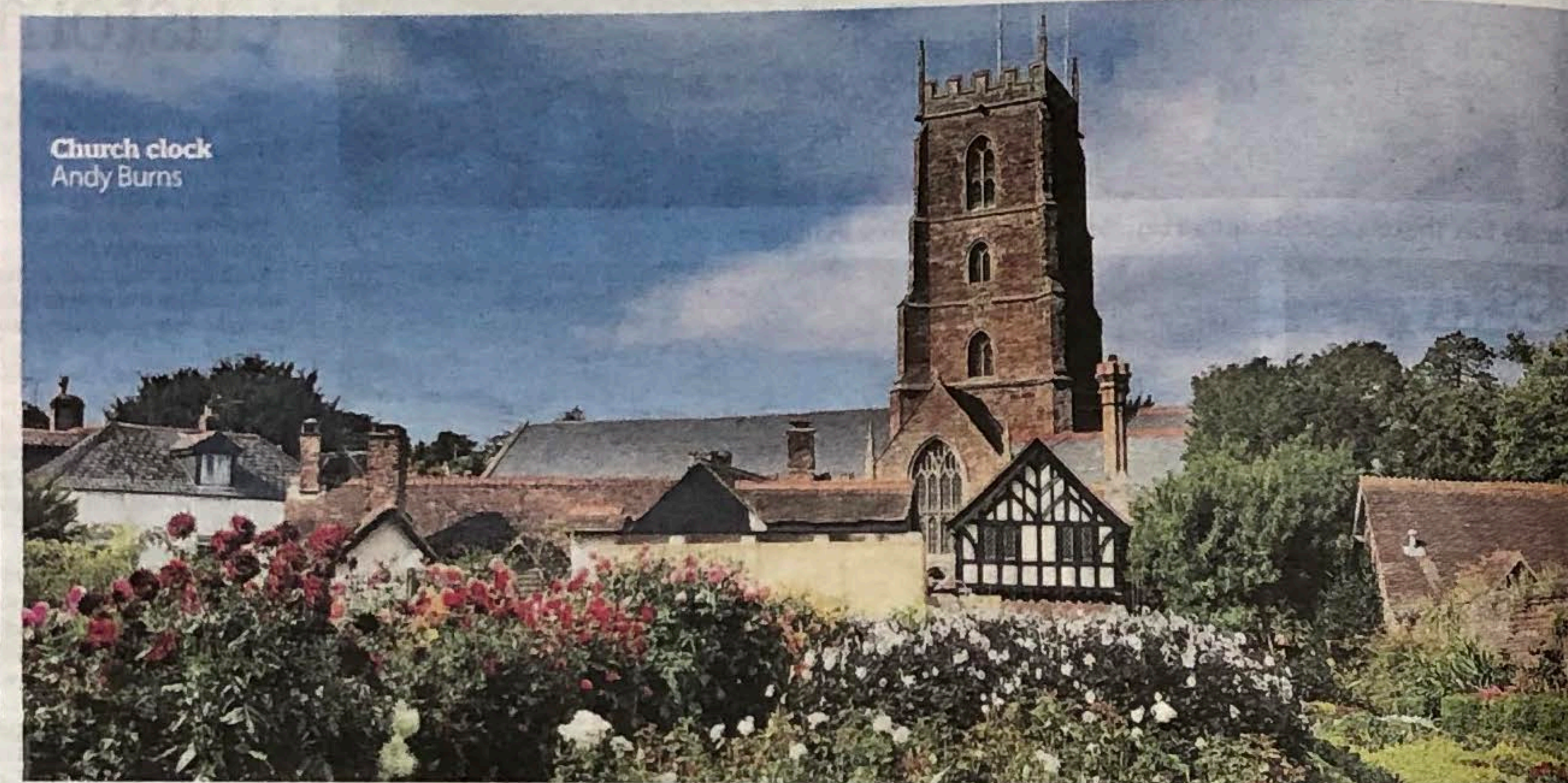
Church clock Andy Burns