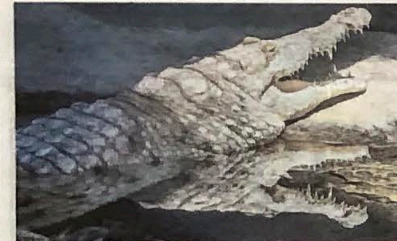
Crocs Ross Happell